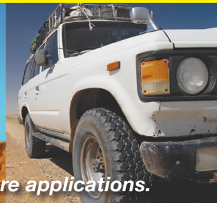
4WD, Mining, Earthmoving, Power Generation and Offshore applications.