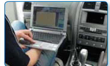
USB connection provides easy, convenient power

Efficient Design Internal heat sink with vented base for effective heat dissipation