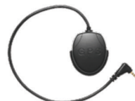
GPS Antenna (GPSANT)