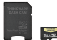
16GB Micro SD Card & SD Adaptor