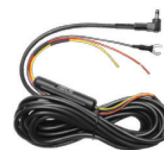
Hard Wiring Cable (HWC)