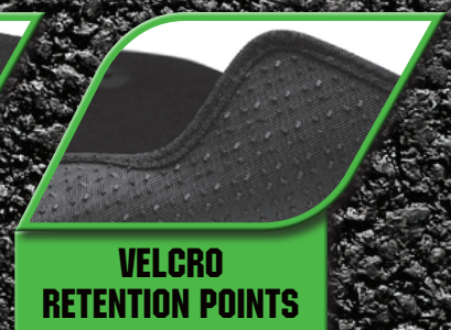
VELCRO RETENTION POINTS