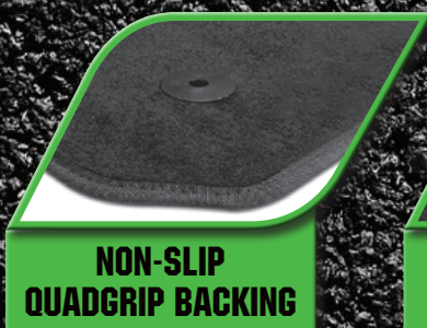
NON-SLIP QUADGRIP BACKING