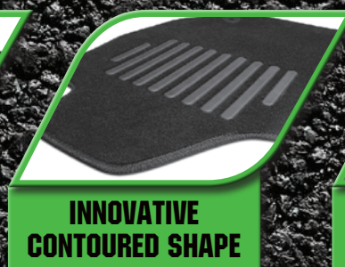
INNOVATIVE CONTOURED SHAPE