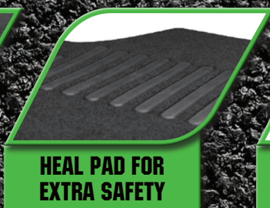
HEEL PAD FOR EXTRA SAFETY