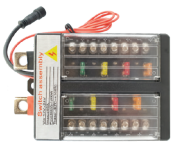
Switch assembly (IP51 rated)