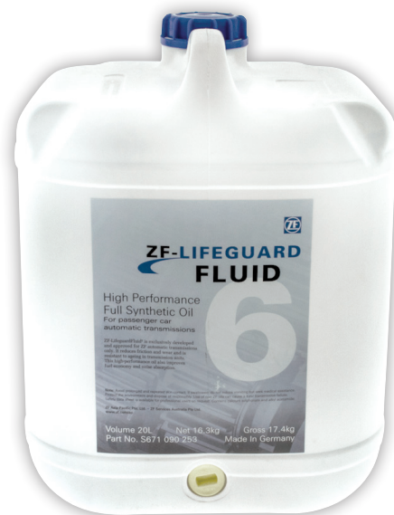
Part No: S671090253