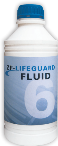
Part No: AA00604149